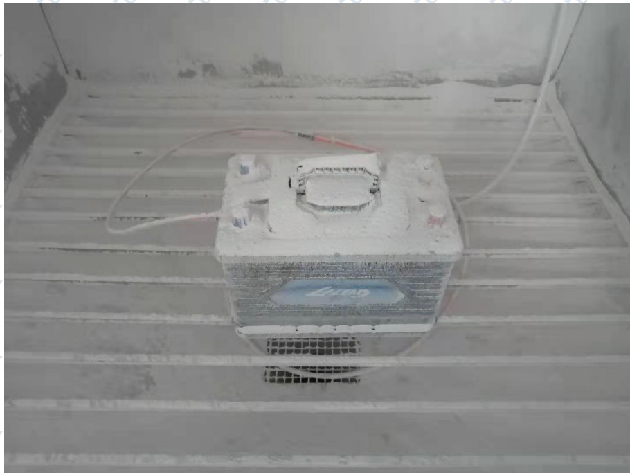
Photo 2 -- Dust-proof testing