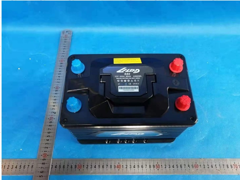
Photo 1 -- Sample