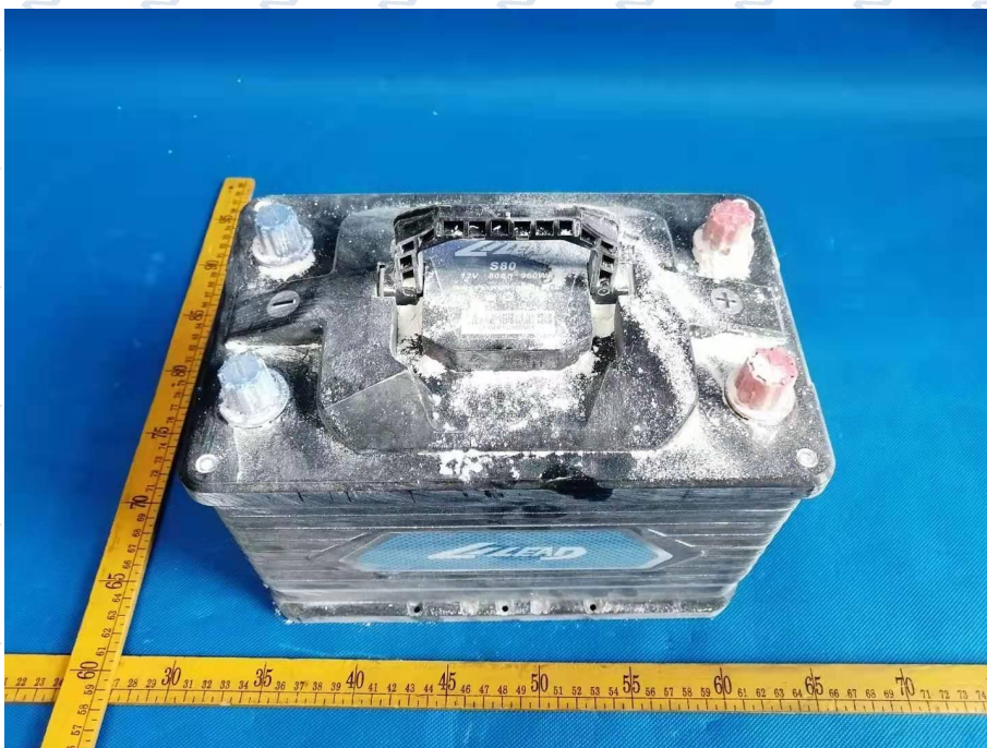
Photo 4 -- After test